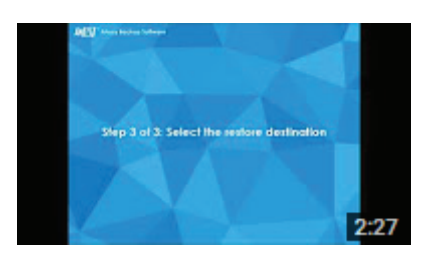
How to restore files to a Synology NAS device using AhsayOBM v7.5 www.youtube.com/watch?v=lkVzzqtglj8