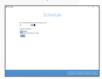
3. Add backup schedule