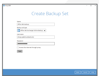
1. Create backup set