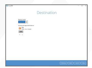
4. Add backup destination