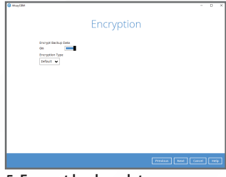
5. Encrypt backup data