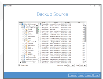
2. Select Office 365 mailbox and items