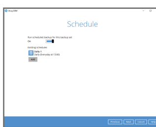
3. Add backup schedule