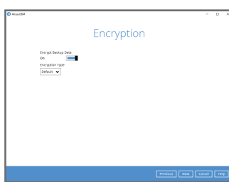
5. Encrypt backup data