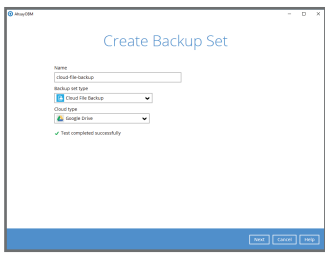
1. Create backup set