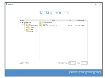
2. Select cloud files