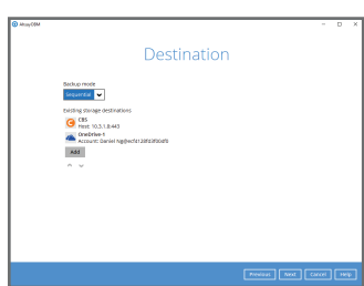
4. Add backup destination