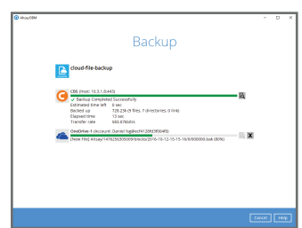
6. Run backup job